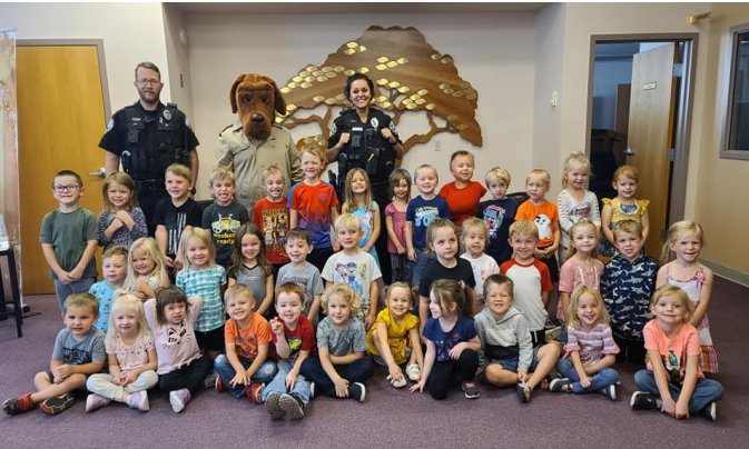
Sturgis Police Officers along with McGruff visit a local pre-school.