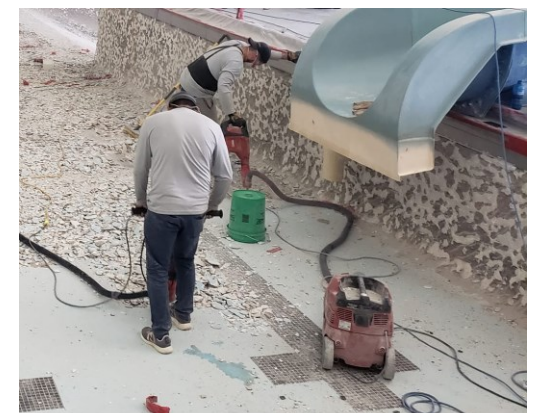
Contractors remove old plaster from the pool surface.

Now Hiring Lifeguards! Flexible Schedules - Fun Atmosphere