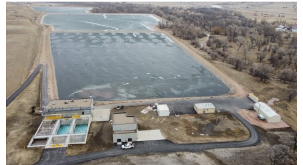
The treatment facility is located east of town, near the previous lagoon system. This plant utilizes the most recent technology and is the first plant of this type in the state.

Contractors made great progress in 2021 constructing the new $14,900,000 wastewater treatment facility. This facility allows the City to obtain operating permits required by the SD DANR. This permit allows the City to operate within federal and state regulations. In addition, this facility will provide capacity for future growth in our community. The plant will operate for one year under the guidance of the CMR prior to the City taking over operations. During this time, the facility will undergo numerous tests and the operations staff will receive training. A public open house will be scheduled for later this summer.