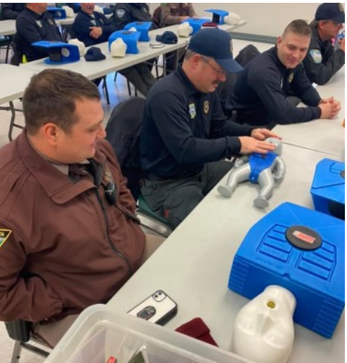
In January, Sturgis Ambulance personnel provided CPR certification training to South Dakota State Troopers and Inspectors.

Each month, the Sturgis Ambulance Service provides CPR training to the community.